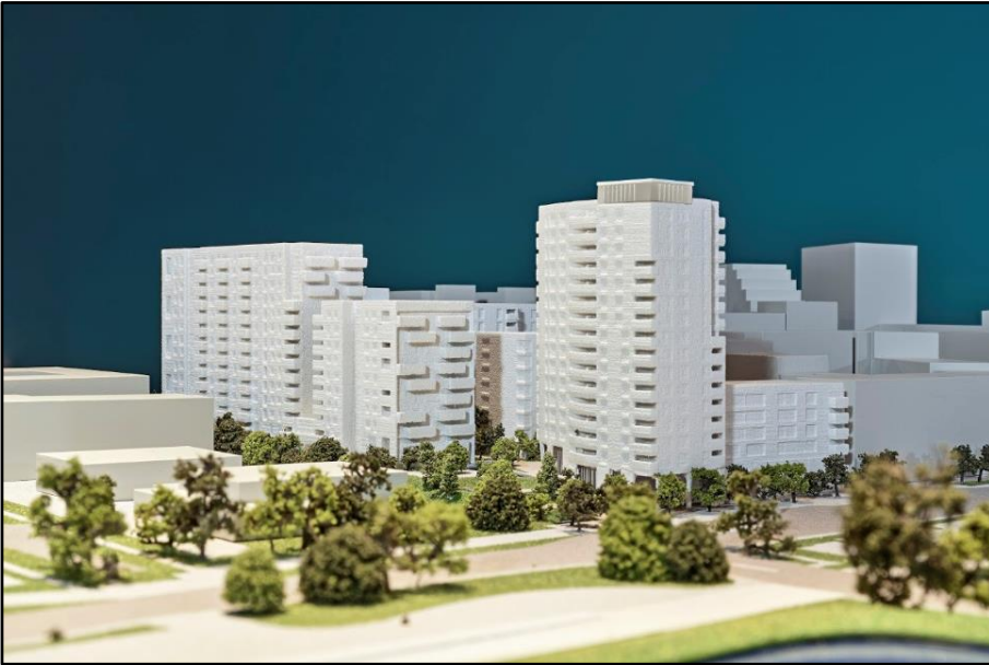
View from Blackthorn Avenue